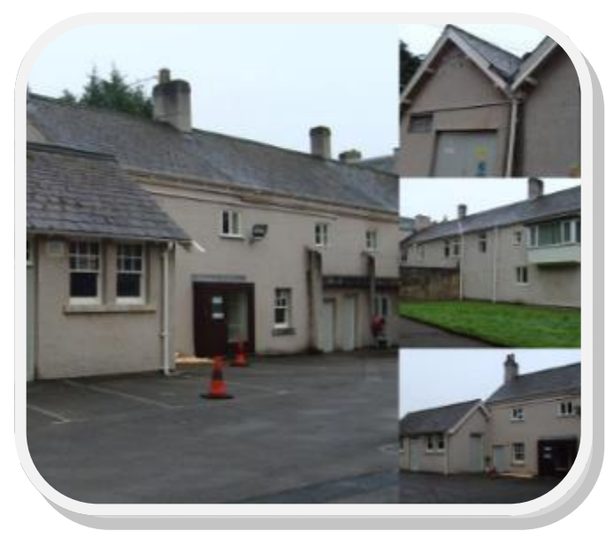
Toulston— timberwork and framework repaired and painted