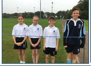
Year 7 Inter-House Cross Country Winners