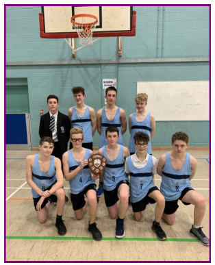
U14 NORTH YORKSHIRE BASKETBALL CHAMPIONS! We are immensely proud of the team who won all 3 of their games in the final.