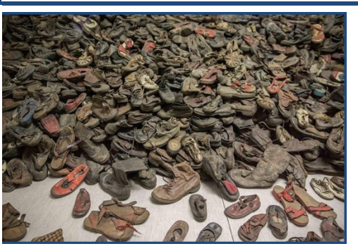
Some of the thousands of shoes which were found at the camp when it was liberated.