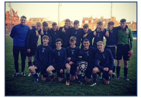
Year 10 Football Team