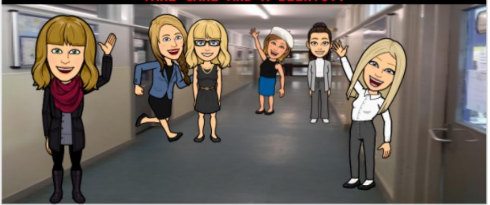
The activities are all still available in the French enrichment folder

It has been a pleasure to be your teachers this year. We hope you have a great Summer and we hope to see you soon in this corridor for some more Language learning! TAKE CARE AND A BIENTOT!