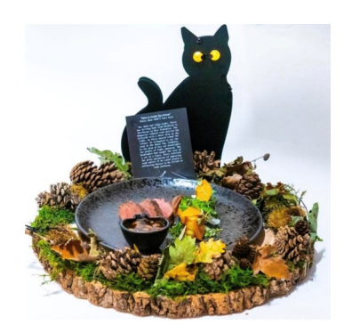
EYES TO GUIDE YOU HOME

The theme for this years competition was 'British Innovation' which was really challenging and exciting, trying to tie the inventions in with the food/ props etc.