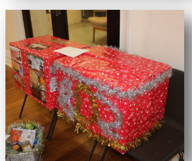
Year 8 Winner 8D2