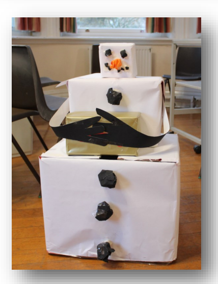
Year 11 Winner 11C1