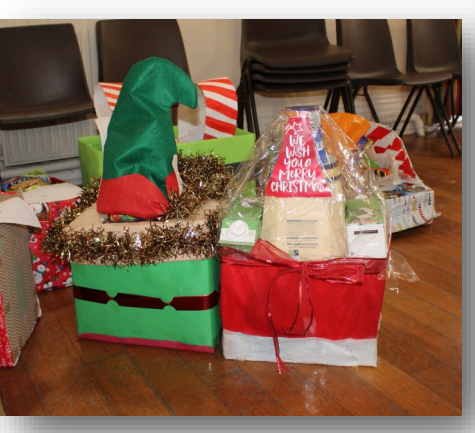
Year 10 Winner 1001