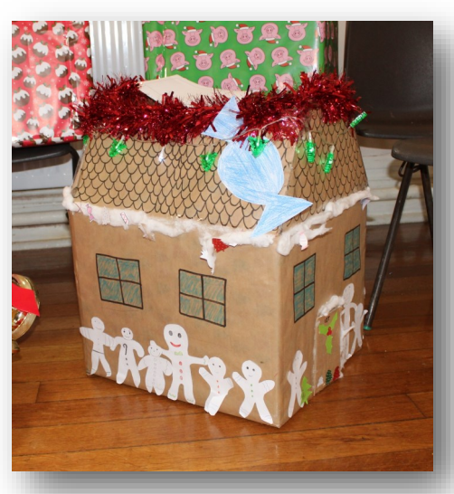
Year 12 Winner Toulston