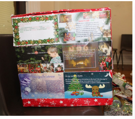
Year 8 Winner 8D2 The Year 8 students in D2 had all written messages and stuck them around their hamper.