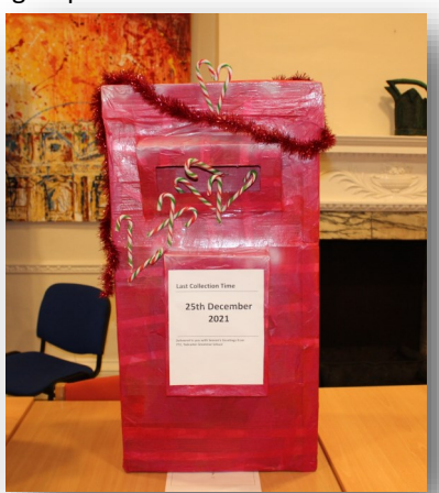
Year 7 Winner 7T2

We don't think anyone in our community should have to face going hungry. That's why the foodbank provide three days' worth of nutritionally balanced emergency food and support to local people who are referred to the centre in crisis. Wetherby and District foodbank is part of a nationwide network of foodbanks, supported by The Trussell Trust, working to combat poverty and hunger across the UK. The amazing hampers produced by each form were judged with a winner from each Year group shown below -