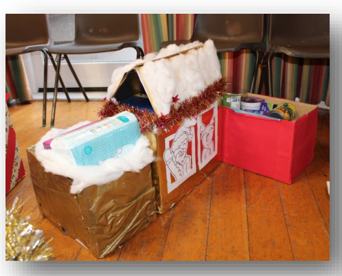
Year 9 Winner 901