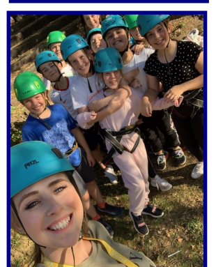
Fingers crossed for a brighter and safer 2022.