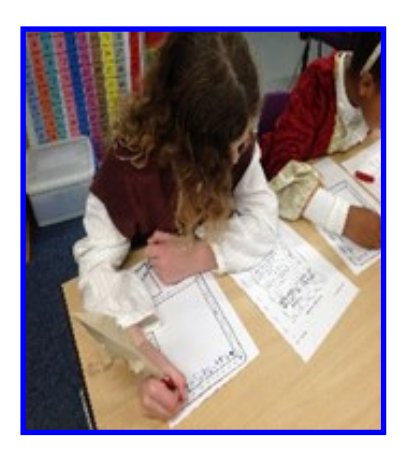
Year 4 Tudor Day

We also decorated the Tree in our Methodist Church in Tadcaster. Christmas is well underway with secret door surprise decorations as well as our Christmas Nativities and shows!. We wish you all a very merry Christmas from all our Staff teams!