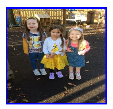
Children in Need Day! – we raised £800!