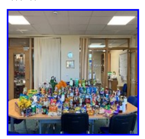
Harvest Festival Amazing donations from our community

We have stayed in touch with our local community by holding virtual and in school events that have raised approx. £1000 for charity including Children In Need and The Poppy Appeal.