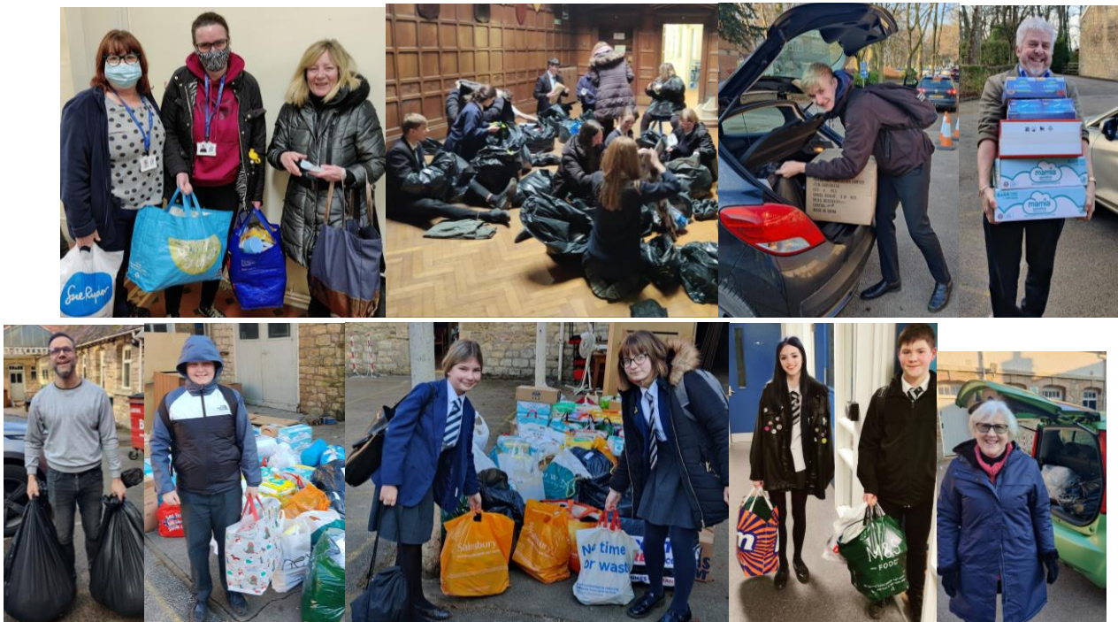
Above: A community responds. Below: A hand-knitted hat in the colours of the Ukrainian flag

In the words of Priestley, a playwright whose work Year 10 students study, 'we are members of one body'. A heart-felt thank you goes to our school and local community for the unprecedented response - the generosity, time, support and sheer will have been truly incredible.