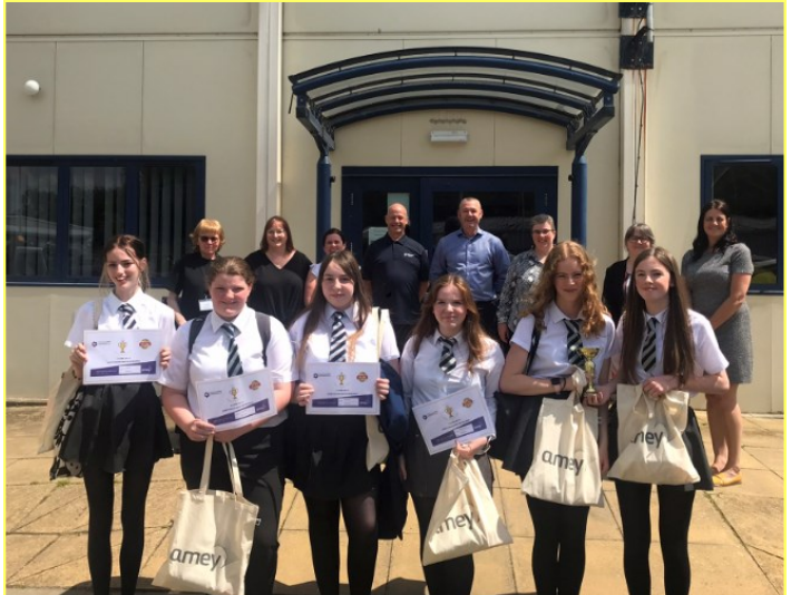
Both of our teams scored equal points of 18/20 with SAS Construction winning the cup on the tie break challenge. An outstanding achievement by both of our teams.