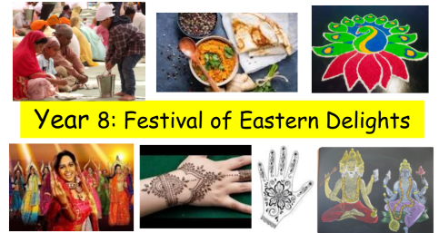
Year 8: Festival of Eastern Delights

If possible, students and staff should bring a scarf or bandana for the Langar ceremony.